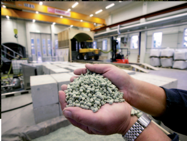
In the Bentonite Laboratory experiments are conducted with bentonite clay in different forms.