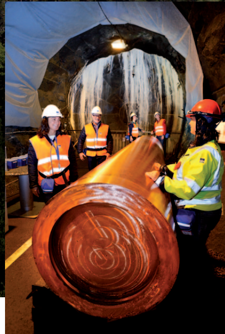
Visitors are welcomed from all over the world.

The models are used for testing technology, methods and equipment for backfilling tunnels with bentonite clay in the form of blocks and pellets. To stack the bentonite blocks, there is a specially adapted stacking robot.