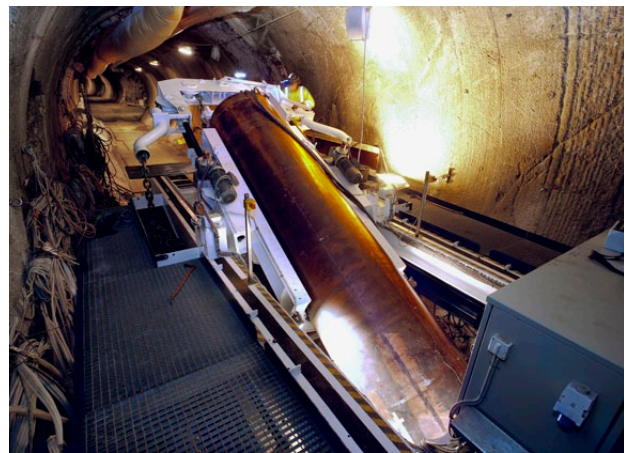
One of the most important full-scale experiments is the Prototype Repository, where six full-scale canisters have been deposited.