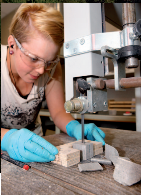
Bentonite samples are prepared in the materials laboratory.