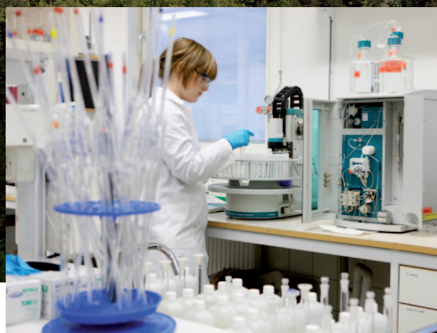
Chemistry of groundwater is analysed in the chemistry laboratory.