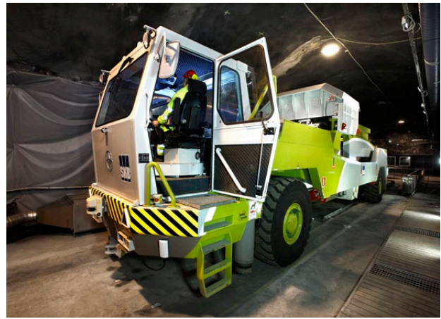
Magne is a prototype of the deposition machine that will be used in the Spent Fuel Repository to deposit copper canisters in the bedrock. It has been developed and tested at Äspö Hard Rock Laboratory. More than a thousand depositions has been conducted with the machine.

As several research issues have been resolved, the experiments at Äspö Hard Rock Laboratory have increasingly focused on technical implementation. It is now a question of adapting the technology to the industrial process that will be used in the operation of the Spent Fuel Repository. We test and demonstrate the technical solutions in practice: how copper canisters are deposited, how the clay buffer is put in place and how the deposition tunnels are backfilled with clay and closed off with concrete plugs. We develop and test the machines and equipment required. We have prototypes of several of the machines that will be used in the Spent Fuel Repository in Forsmark, for example a machine that deposits copper canisters and a robot that backfills tunnels after deposition.