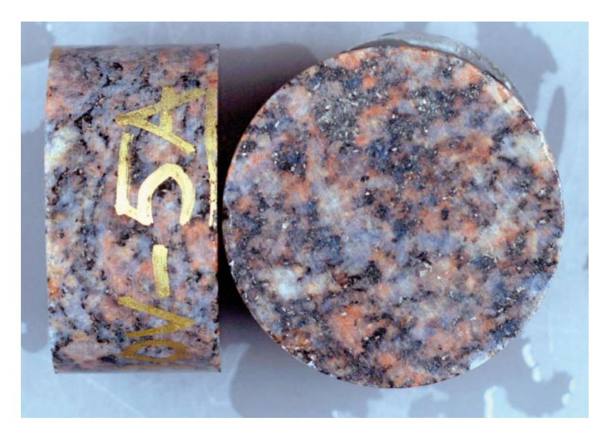
Figure 5-5. Specimens KLX07A-90V-05.