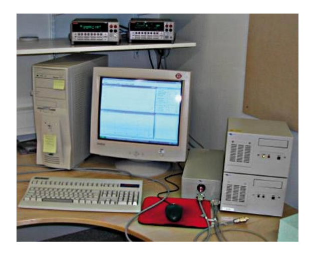
Figure 3-1. TPS-apparatus with source meter, multi-meter, bridge, and computer.

The experimental set-up is shown in Figure 3-2.