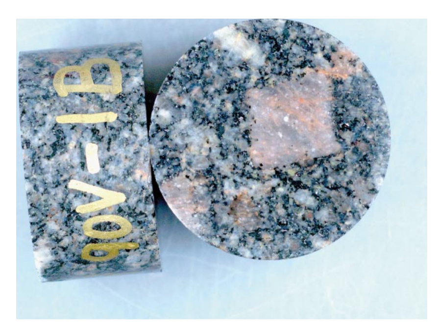
Figure 5-1. Specimens KLX07A-90V-01.