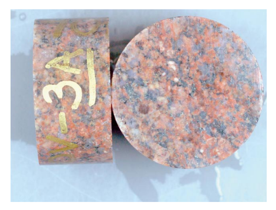
Figure 5-3. Specimens KLX07A-90V-03.