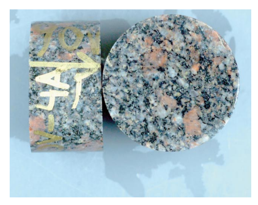
Figure 5-4. Specimens KLX07A-90V-04.