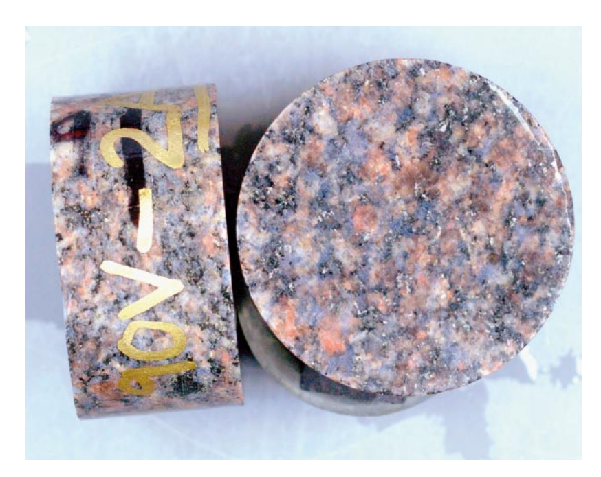
Figure 5-2. Specimens KLX07A-90V-02.